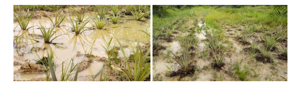
Figure 2. Flood at pineapple field at 2 months after planting during heavy rain in lowland (Chalermprakiat district, Nakhon Si Thammarat, Thailand)